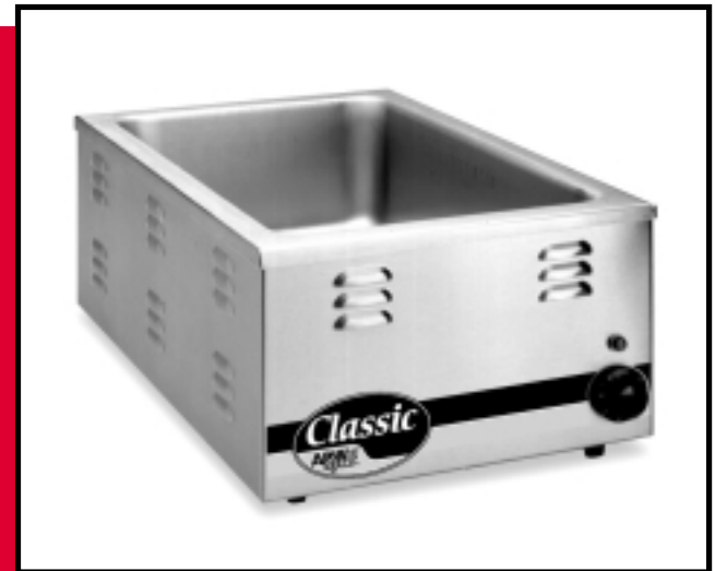
MODEL W-3V COUNTERTOP WARMER