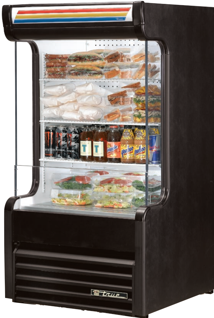
Shown with optional exterior.