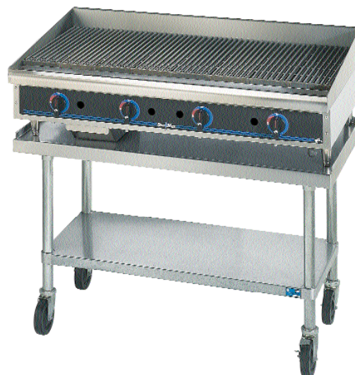
Model 6048CBD with Optional Equipment Stand and Casters